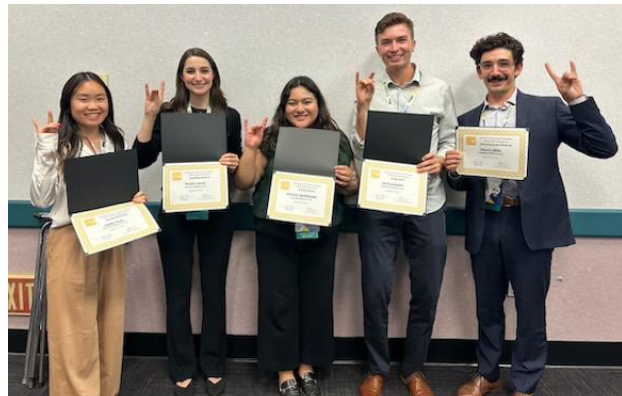
UCI student scholarship winners at the 2023 APA California Conference: Planning at the Crossroads